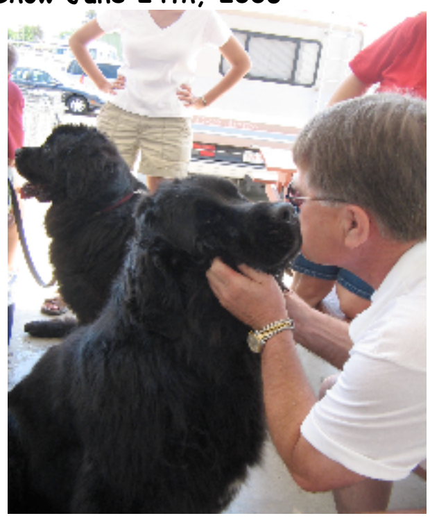
Lloyd & Sapphire count kisses!