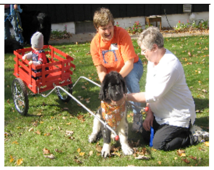
Marty's ready! Okay, Thumper - your turn!