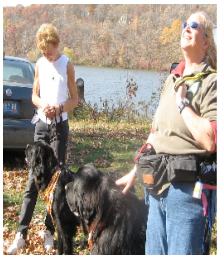
What a gorgeous fall day!