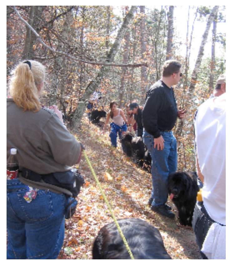
High on the Fr. Rapids bluffs above the Mississippi