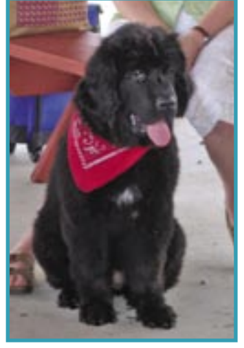
A young fan looks on.