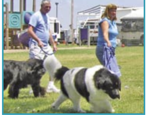
Ready for the games to begin.