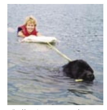
"I'll take you to shore"