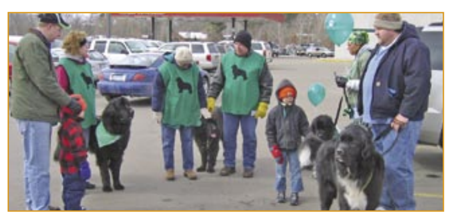
Waiting for the parade to begin.