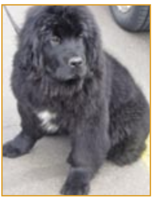
Can we all say "awwwwwwww".