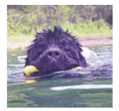
To the rescue with a life ring

Come prepared to learn, to have a good time with your dog and other Newfy owners...and to get wet!!