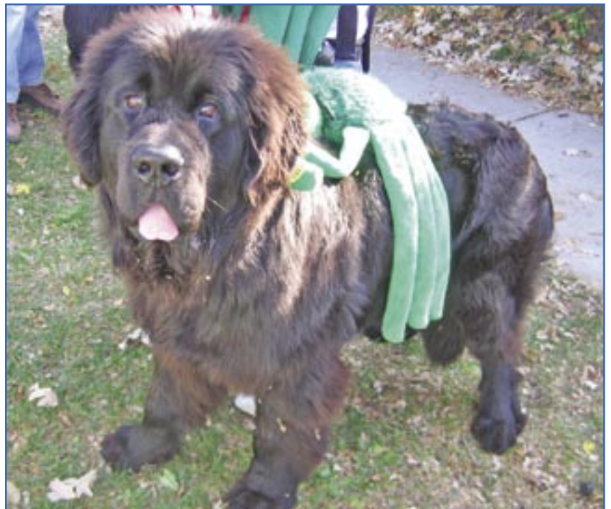
Monte doing the Monster Mash.