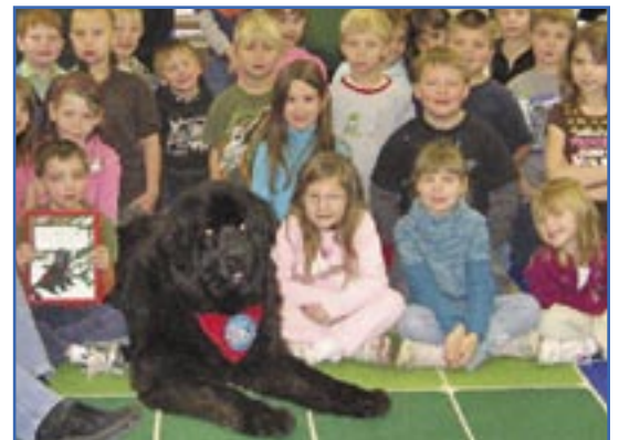
Albert, the "Reading Dog," as a TDI, is a good listener!