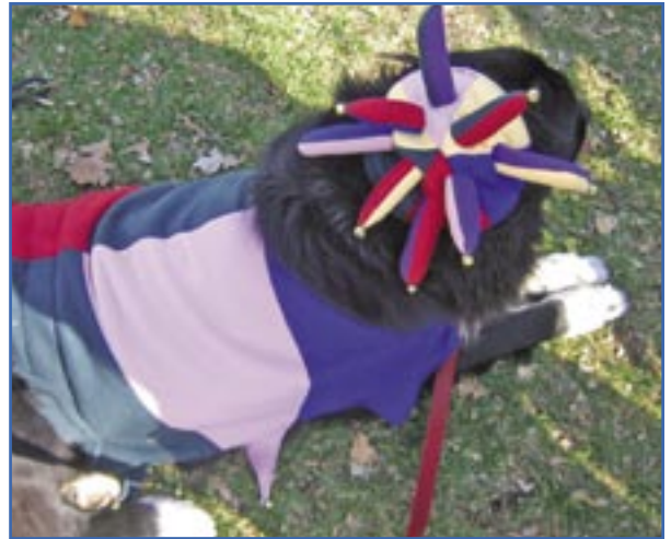
Sully does not think his costume is any laughing matter.