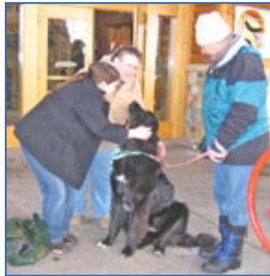
Ruby enjoying some lovin'.