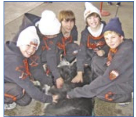
Sully getting a belly rub from a group of hockey players.