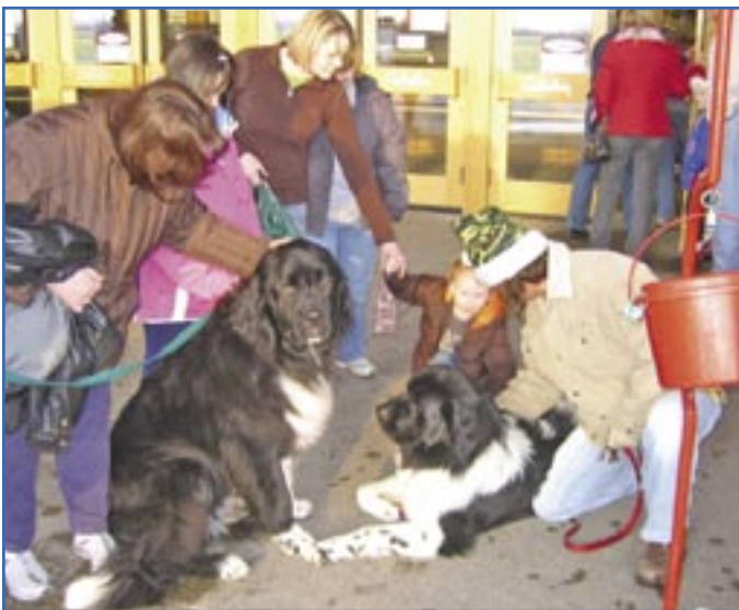
All in a days work for Sully and Peanut.