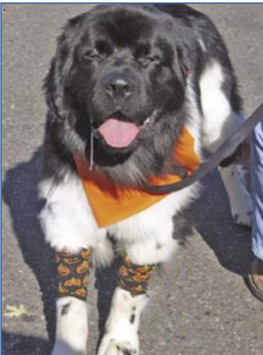
Peanut, do not get any drool on your halloween costume.