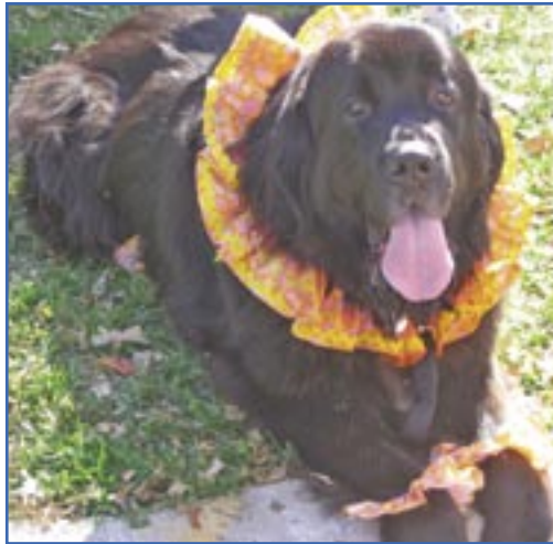
Breezy is just clowning around and waiting for the parade to begin.