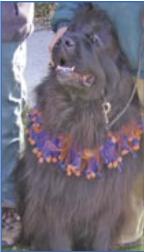
Gitchie thinks his collar is itchy.