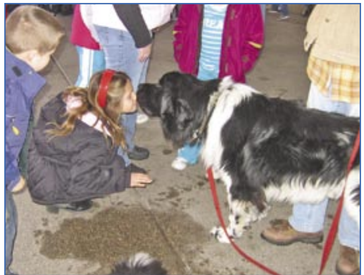
Peanut giving out kisses to raise money for the Salvation Army.